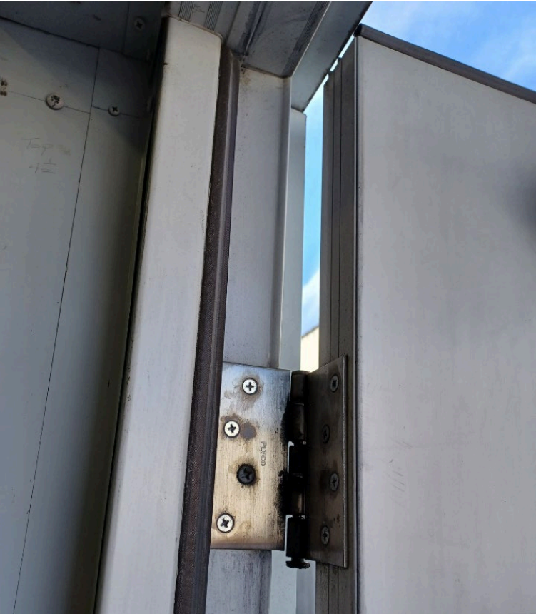
PHOTO OF LATCH IN PANEL