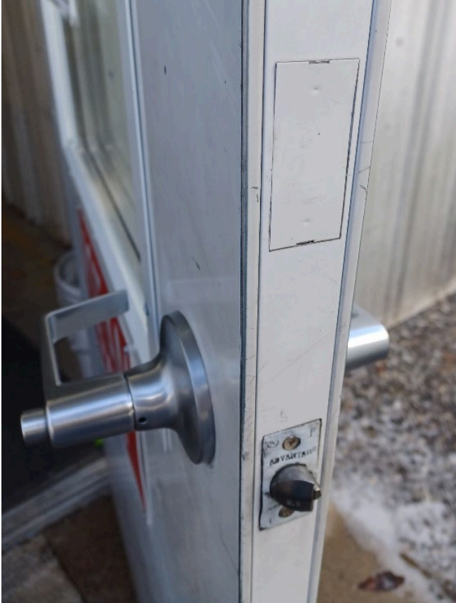
PHOTO OF TOP EDGE OF PANEL